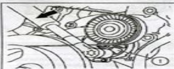
1. Натяжное устройство ремня