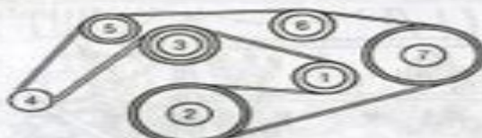
Двигатель OM611: ремень привода вспомогательных механизмов