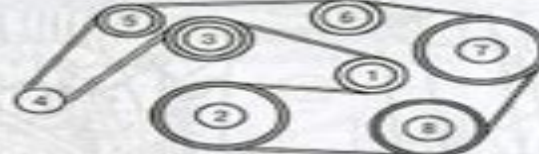
Двигатель OM611: ремень привода вспомогательных механизмов с компрессором кондиционера