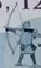
BATTLE OF LEWES

In the same year Simon de Montfort and the King fought again, at the Battle of Evesham, and Simon was killed.