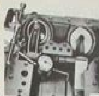
Fig. 2. Checking End Clearance.

washer. The thrust washer is slightly too tight and is available in three sizes.