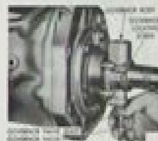
Fig. 4. Removal or Installation of Governor Valve and Shaft