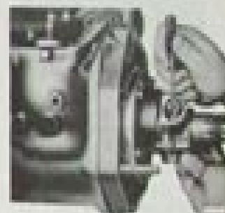
Fig. 3. Removal or Installation of Governor Valve Shaft Snap Ring