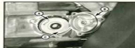
Author disclosures of potential conflicts of interest and author contributions are found at the end of this article.