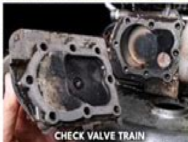
CHECK VALVE TRAIN