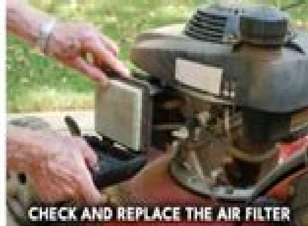
CHECK AND REPLACE THE AIR FILTER