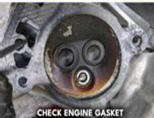
CHECK ENGINE GASKET