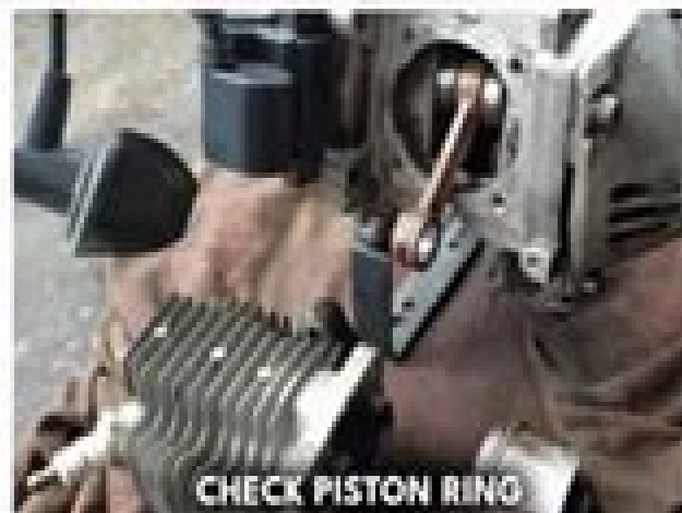
CHECK PISTON RING