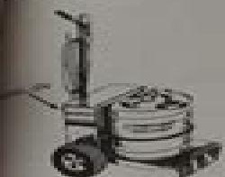
25 Gallon Gas