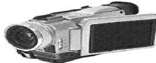
Photo : DCR-TRV20E RMT-811