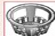
Aluminium die-cast basket structure

During high SPL levels, the motor assembly is placed under extreme pressure. So Pioneer developed an exclusive aluminium die-cast basket which securely supports the motor. This basket structure prevents any unwanted flex or vibration that can cause energy loss and reduce overall performance. A solid winner!