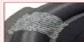
3-layer fibre woven radial surround: an extremely durable and high-performance radial surround

The whole range of new Pioneer subs is outfitted with a patent-pending 3-layer Fibre Woven Radial Surround design. The surround consists of two outer layers (rubber for the TS-W15000SPL) and one inner layer of interwoven fibre (Aramid fibre for the TS-W15000SPL) with a honeycomb weave for even distribution throughout the surround material. This eliminates weak points and improves the high power capability for an extremely durable and resilient surround that resists puckering, even under the extreme power conditions of SPL competitions.