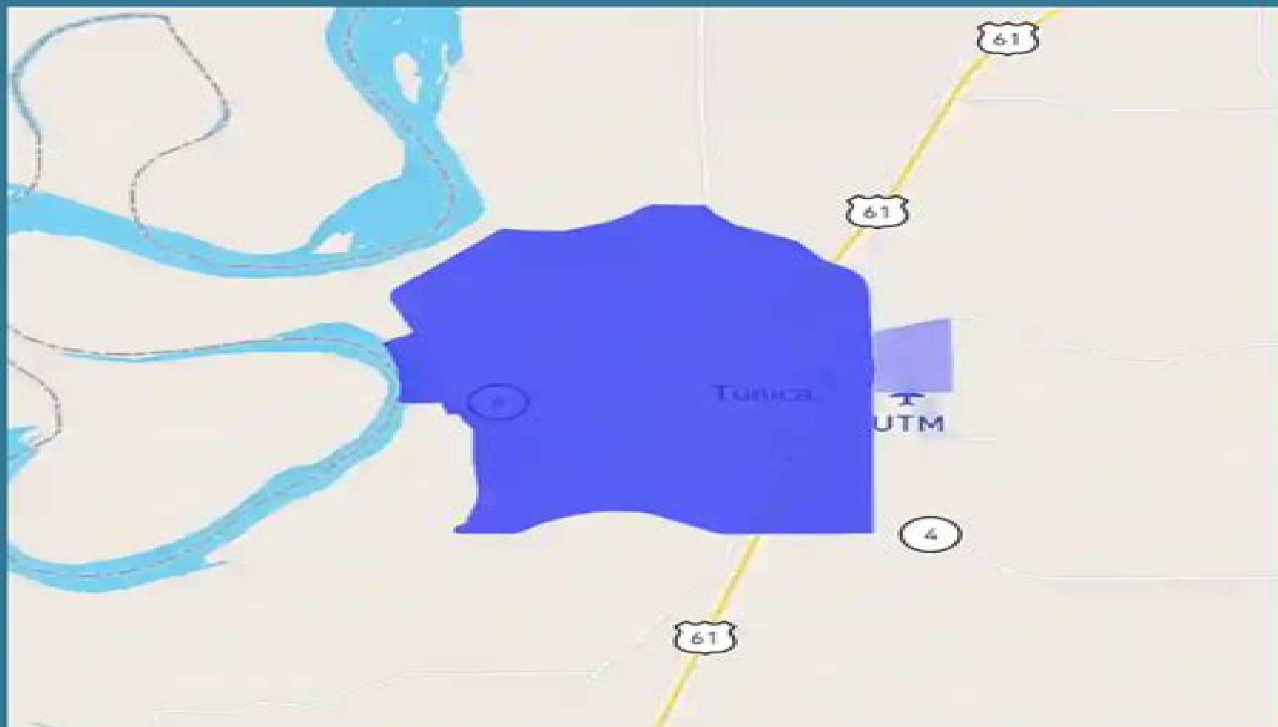
Tunica, MS Crime Map By Neighborhood

(click to see interactive crime map and report)