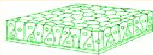
C. Pseudostratified columnar epithelium