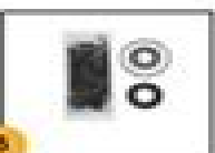
3 Gear Assembly Adjuster Plug