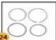
24 Valve Ring