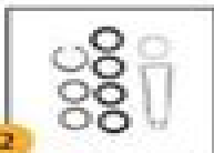
2 Gear Assembly Lower Shaft