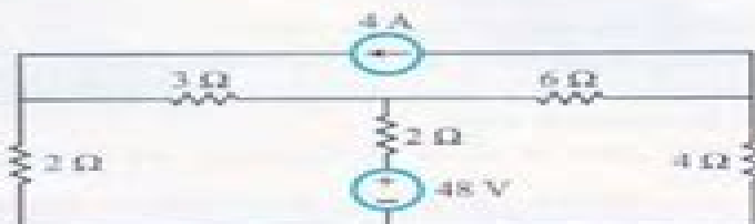
Figure P1.9: Circuit for Problem 1.9.