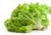
Leaf Lettuce 16