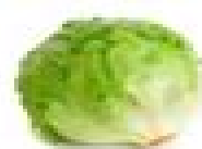
Head Lettuce 4