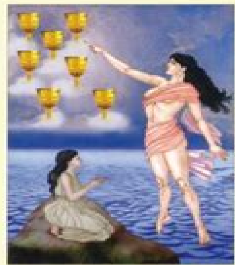
SEVEN OF CUPS