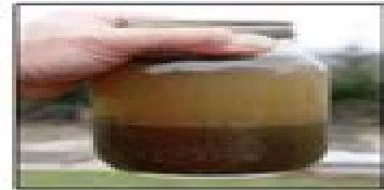
Water and Sand