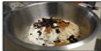
Cake Ingredients (before blending)