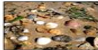
Sand and shells