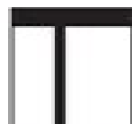
Model 632/PF Framed