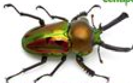
Rainbow stag beetle