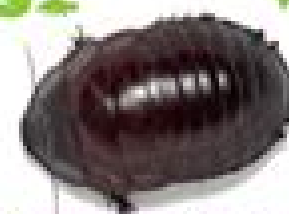
Giant Burrowing Cockroach