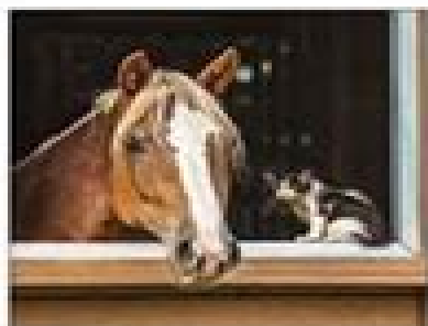
Components analysis may be flawed for numerous reasons.