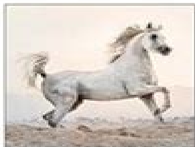
The above are not the only ways that