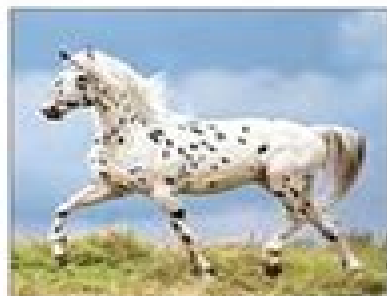
The grass isn't always greener on the other side of the fence.