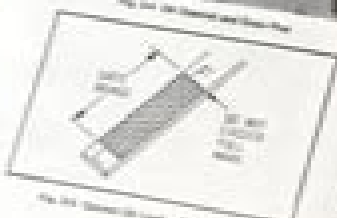
Fig. 1-3: 1/2" nut located on the left side of the engine.

Remove the 1/2" nut located on the left side of the engine. The 1/2" nut is located on the left side of the engine.