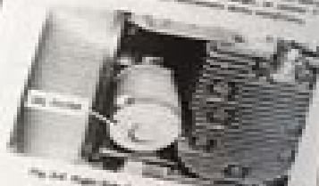
Fig. 1-4: 1/2" nut located on the left side of the engine.

The engine oil filter is located on the left side of the engine. The oil filter should be changed when the engine is warm.