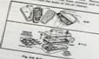
Fig. 2-1: 1/2" nut located on the left side of the engine.

Remove the 1/2" nut located on the left side of the engine. The 1/2" nut is located on the left side of the engine.