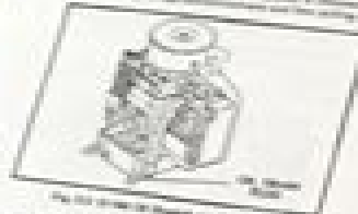
Fig. 1-1: 1/2" nut located on the left side of the engine.

Remove the 1/2" nut located on the left side of the engine. The 1/2" nut is located on the left side of the engine.