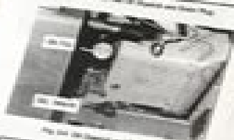
Fig. 1-2: 1/2" nut located on the left side of the engine.