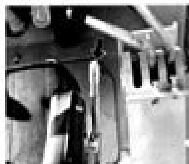
Fig. 14. Adjust Parking Brake at Handle

Further adjustment is provided by a screw at the brake arm, see Figure 15. First be sure that screw on lever is locked off, so that all slack can be taken up at the screw. Brake lever should be in released position.