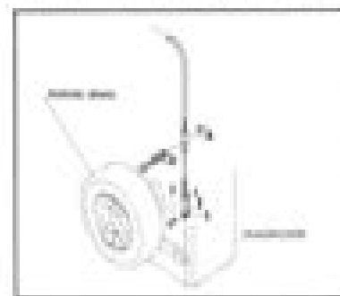
Fig. 15. Adjust Parking Brake Arm