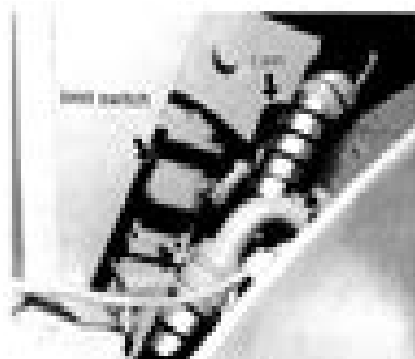
Fig. 12. Brake Room

To obtain maximum length without vertical bracket should be installed in bottom view of frame bracket. The load operation cycle time can be reduced according to the maximum lift to which the boom is set.