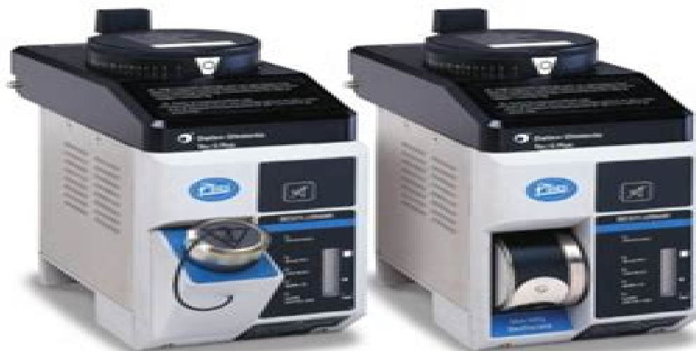
Tec 6 Plus Fixed Filler*