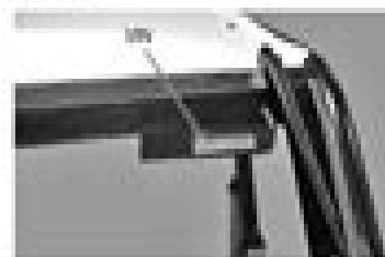
Fig. 1 VIN Location

The VIN is located on the driver side near the top of the windshield.