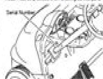
Fig. 2 Serial Number Location on Steering Column

In order to obtain correct components for the vehicle, the manufacture date code, serial number and vehicle model must be provided when ordering service parts.