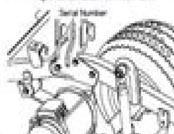
Fig. 4 Serial Number on Rear Frame