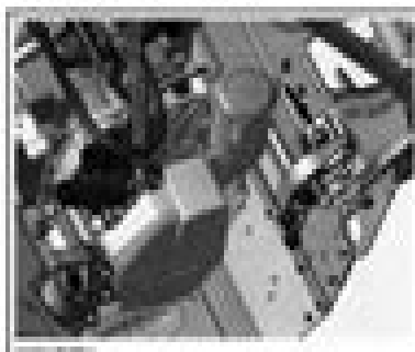
FRONT ENGINE SUPPORT