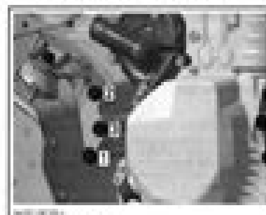
REAR ENGINE SUPPORT