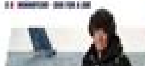
Just LE CAM FR FRANCE