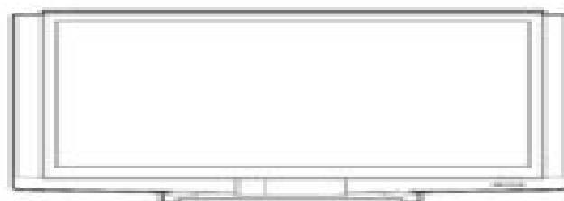
KDF-60XBR950 or KDF-70XBR950