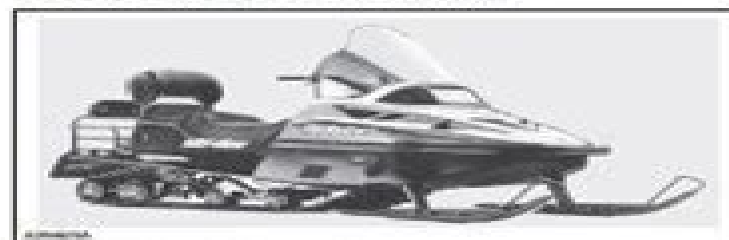
TYPICAL — SKANDIC SERIES