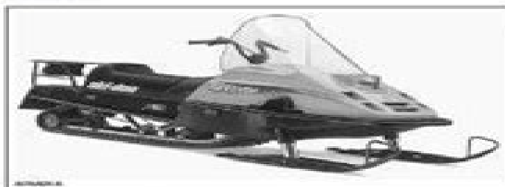
TYPICAL — TUNDRA R

Skandic LT Skandic LT E Skandic WT Skandic SWT Skandic WT LC Skandic SUV