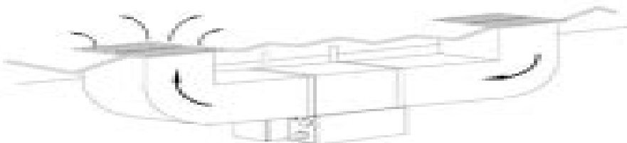
Figure 2: 60-BC1 Connected to Duct

See Wiring Diagram (Figure 3) on Back ►►►