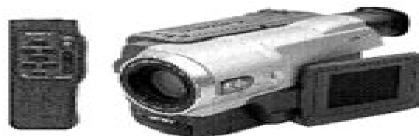
Photo : CCD-TRV108

US Model Canadian Model CCD-TRV108/TRV308/TRV608