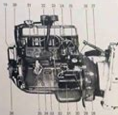
Fig. 4. 402/100. Front view. Reference No.: see page 55