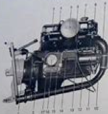
Fig. 1. 402/100. Backward view.