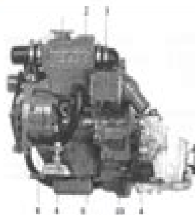
MD2010AB & MD20