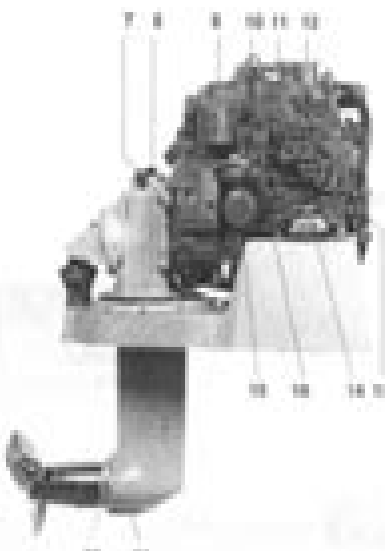
MD2010AB & MD20