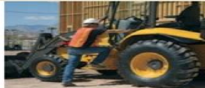
• Entry and exit: quick, safe and easy.

When you can't afford to lose a single day's work to service or repairs, it pays to go with a name you can trust. Volvo Backhoe Loaders are backed by a standard Volvo warranty and a reliable dealer/service network to keep you up and running. Contact your local Volvo dealer to learn about the benefits of available extended warranty programs.