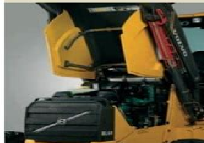
• Rear-tilting one-piece hood.