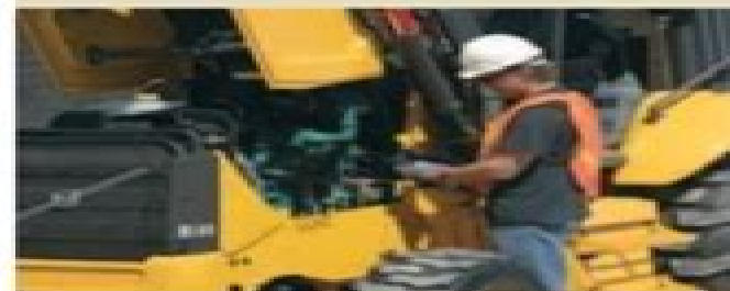
• Ground-level service; long intervals.