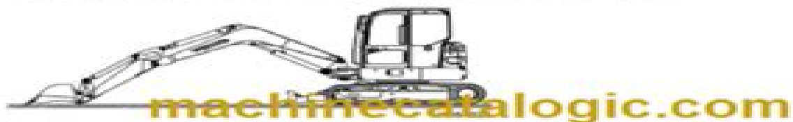
Figure 1 Service position A

Park the machine on a horizontal and firm surface. The suitable position is indicated in the description for the various service jobs.