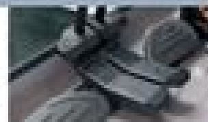
Adjustable power mirrors can reduce blind spots

The airconcess features a gas duct mixing freely to open and provide fresh. There's also heated mirrors and heated air conditioning with the ability for excellent cooling of the cab. A standard radio/cassette player with two speakers increases comfort. Power windows, radio and heater dramatically reduce noise levels in and out of the cab. Operate all operations without fatigue while those working nearby will appreciate a quieter environment.