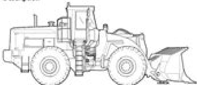
Figure 1 Wheel loader 1200

1200 is a two-wheel drive articulated wheel loader.