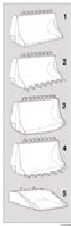
The five most common types of buckets