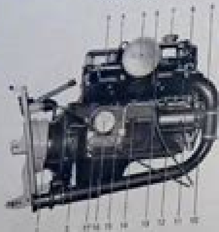
Fig. 1. 402/100. Backward view.