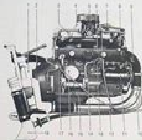
Fig. 3. 402/104. Backward view. Reference No.: see page 55