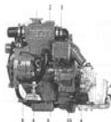
MD2010A/B & MD20