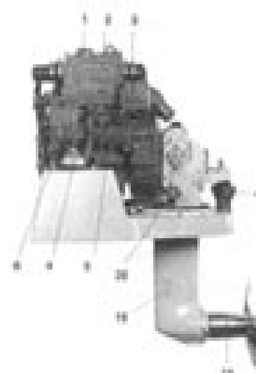
MD2010A/B & MD20