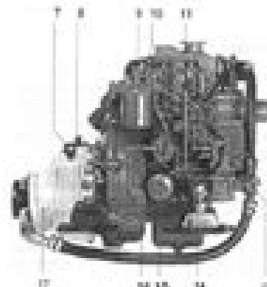
MD2010B & MD2020B