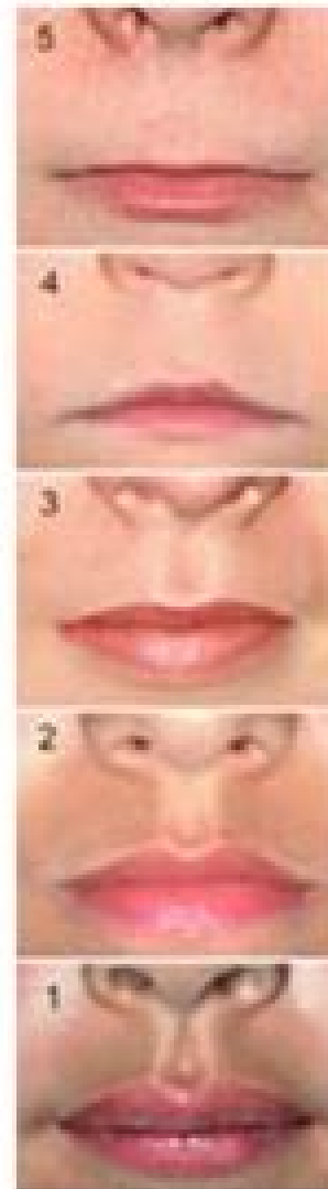
Lip-Philtrum Guide 1

http://depts.washington.edu/fasdpn/htmls/order-forms.htm