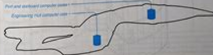
4.1.1 Location of main computer cores

Memory storage for main core usage is provided by 2,048 dedicated modules of 144 full-size optical storage chips under LCARS software control. These modules provide average dynamic access to memory at 4,000 kilobytes/sec. Total storage capacity of each module is about 630,000 kilobytes, depending on software configuration.