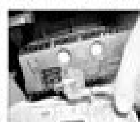
4.6a ... undo the heater retaining screws using sockets from the panel ...

draw them from the rear panel. If necessary, undo the screws and remove the multi-function display unit from the panel (see Illustration 6) .