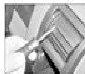
4.6b ... undo the heater retaining screws using sockets from the panel ...