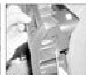
4.7b ... undo the heater retaining screws using sockets from the panel ...