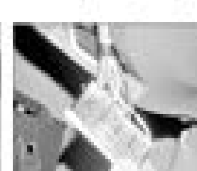
4.7c ... undo the heater retaining screws using sockets from the panel ...