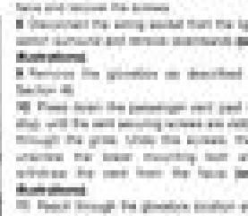
4.7a ... undo the heater retaining screws using sockets from the panel ...

draw them from the rear panel. If necessary, undo the screws and remove the multi-function display unit from the panel (see Illustration 6) .