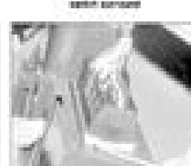
4.6c ... undo the heater retaining screws using sockets from the panel ...