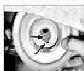
4.8 Refit the crankshaft pulley aligning the cut-out with the timing notch on the crankshaft sprocket (removed)