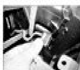
4.5a ... undo the heater retaining screws using sockets from the panel ...

7 Remove the light switch located on the