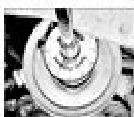
4.9 Fit the new retaining bolt and tighten it as described in the text