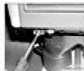
4.6 Undo the heater retaining screws using sockets from the panel ...

draw them from the rear panel. If necessary, undo the screws and remove the multi-function display unit from the panel (see Illustration 6) .