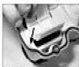
4.3 Ensure the gasket is correctly located in the crankshaft cover recess (removed)

7 If necessary, remove the hold bar securing the driveplate in the transmission housing