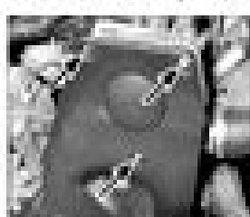
4.10 Timing belt upper cover retaining bolts (removed)