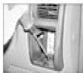
4.5b ... undo the heater retaining screws using sockets from the panel ...