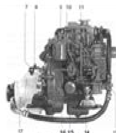
MD2010A/B & MD2020