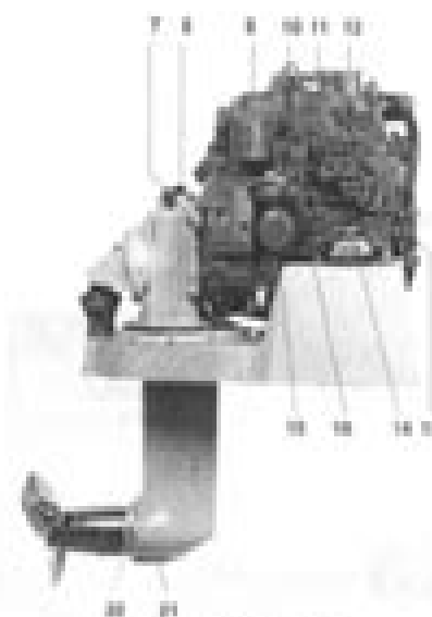
MD2010A/B & MD2020