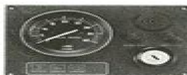
Instrument panel with tachometer and alarm display for oil pressure, coolant temperature, and charging.