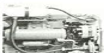
Freshwater cooling extends engine service life, reduces the risk of corrosion and also provides for a hot water outlet.