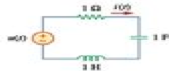
Figure 16.35 For Prob. 16.1.

Determine i(t) in the circuit of Fig. 16.35 by means of the Laplace transform.