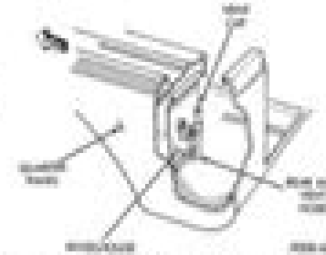
Fig. 22 Rear Axle (Left Side) - Woodhopper - XJ Vehicles