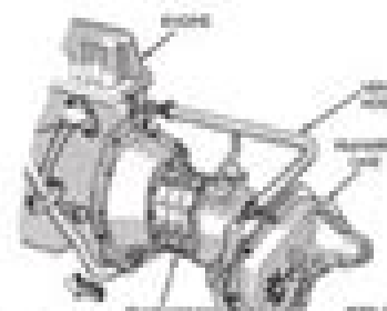
Fig. 19 Transfer Case (Left Side) - Typical