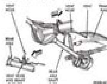
Fig. 20 Rear Axle (Left Side) - XJ Vehicles

(2) Inspect the surface of frame and tubing for heat and mechanical damage. Frame and tubing heated close to an exhaust pipe should be given special attention.