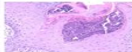
2) SKIN, LEFT NECK, SHAVE BIOPSY