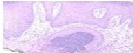
1) SKIN, RIGHT ARM, SHAVE BIOPSY