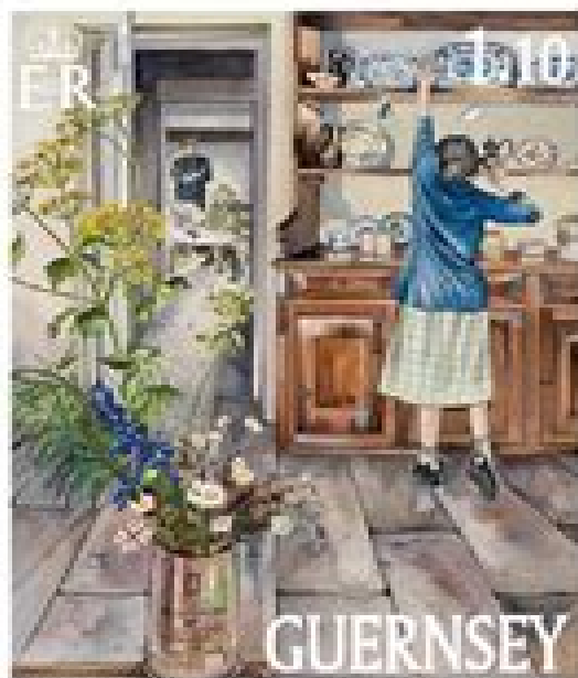
The Book of Ebenezer Le Page: Liberation Day