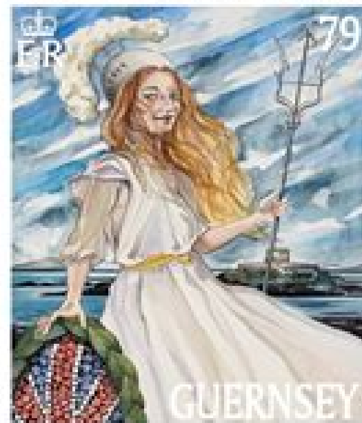
The Book of Ebenezer Le Page: Liza Quoirpel