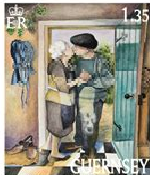
The Book of Ebenezer Le Page: Ebenezer and Liza