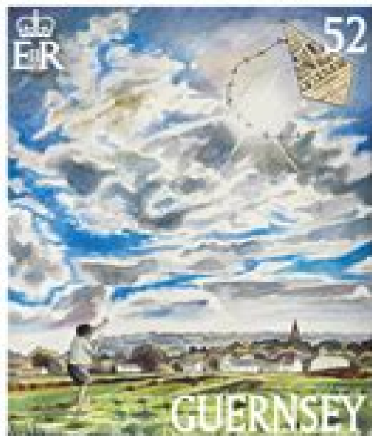
The Book of Ebenezer Le Page: Ebby on the Common