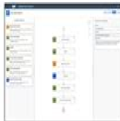
Process Variant (No Code) Configuration UI for Business Experts

Integrated Business Rules Management to deploy into hybrid landscapes