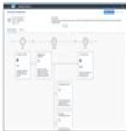
Business Rules (Low Code) Decision Management and Enterprise Rules Model

Application developer- focused workflow modeling and process automation