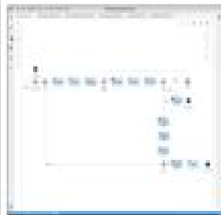
Workflow Editor (Low Code) Application Workflow

Application developer- focused workflow modeling and process automation