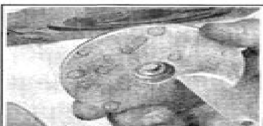
Fig. 23 Although many outboards use the trim tab as an anode . . .