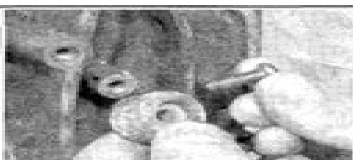
Fig. 27 Most anodes are easily removed by loosening and removing their attaching fasteners