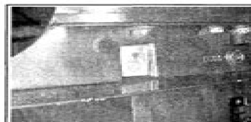
Fig. 25 . . . and this one on the lower unit