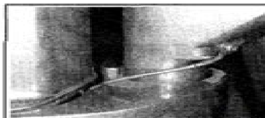
Fig. 28 One of the many lead wires used to connect bracketed parts. Lead wires are used as an assist in reducing corrosion