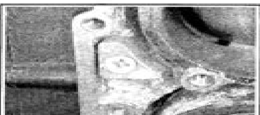
Fig. 26 Anodes installed in the water jacket of a powerhead provide added protection against corrosion