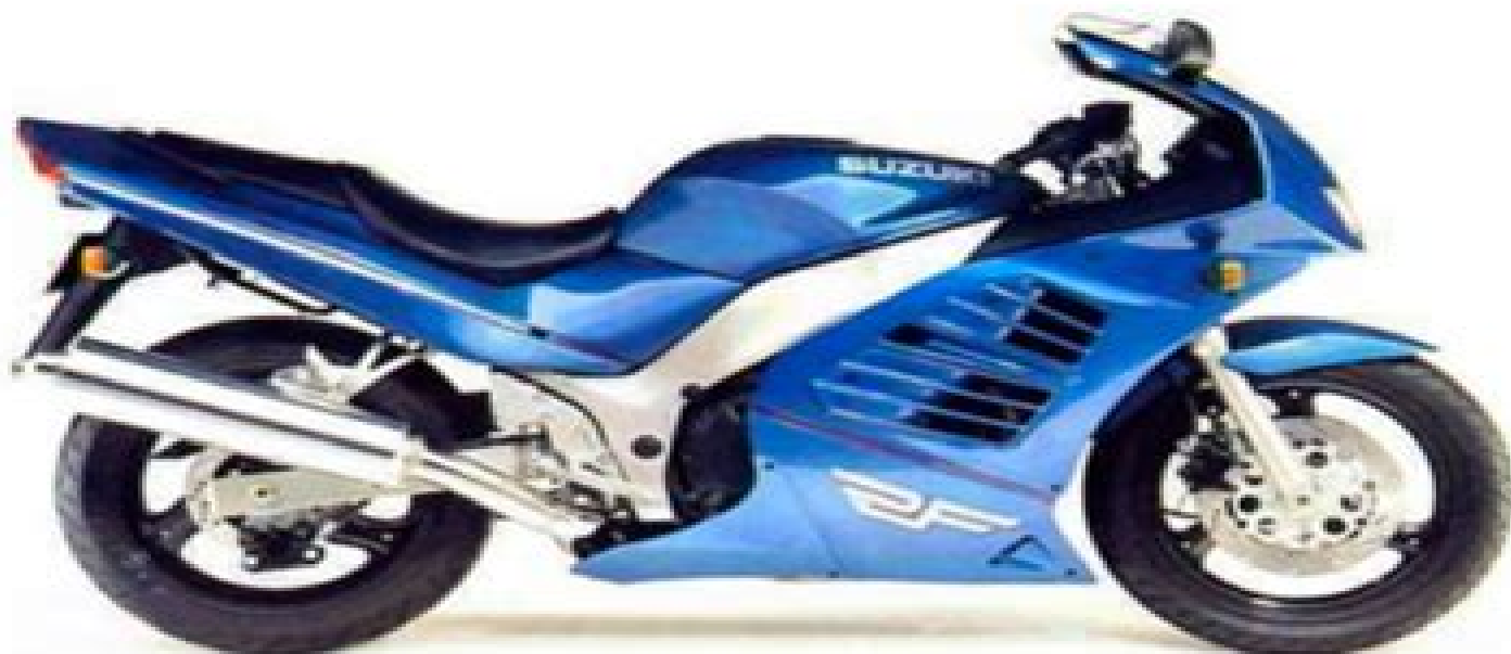
Suzuki RF600R 1993 - 1997